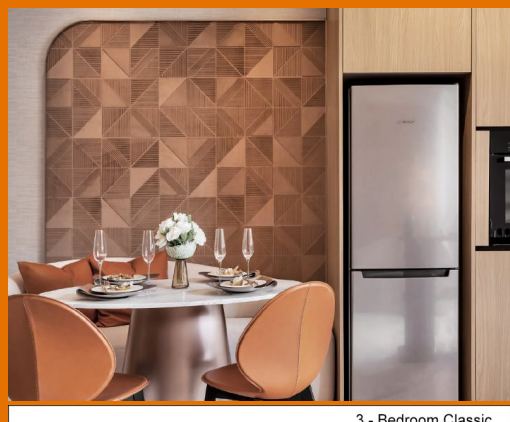
3 - Bedroom Classic